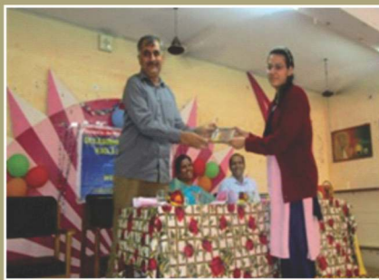
Student Appreciation in Parents' Meeting