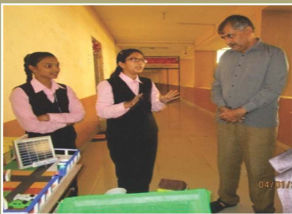
Educational Exhibition (2017-18)