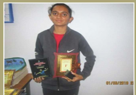
Sports Winner In State/National