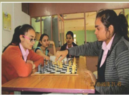
Sports day celebration