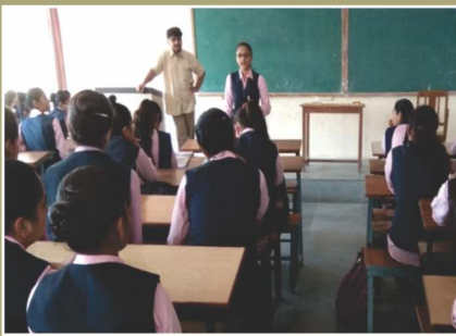
Class room Presentation