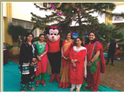
Trade expo 2018-19