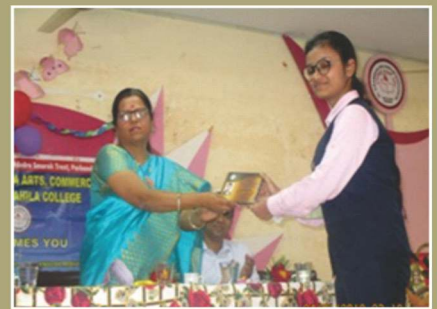
Student Appreciation by Guest's in parent's meeting