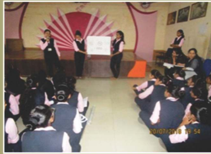
Chart making competition