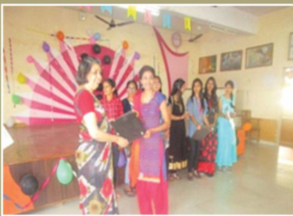
Student Appreciation by guest in Parents' Meeting