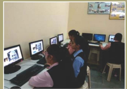
Gandhi Jayanti Online Quiz