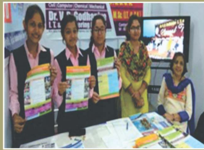
Advertisement campaign By Students