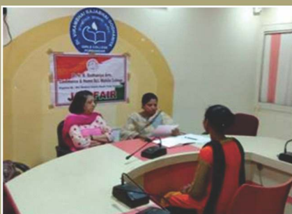
Placement for the final year students