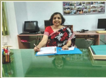
Coordinator of B.com(EM)