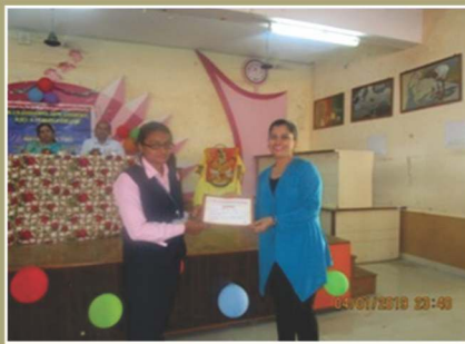
Award by Mother of Student in PTA-Meet.