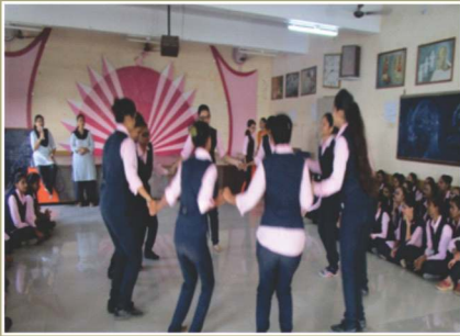
Activity based Learning