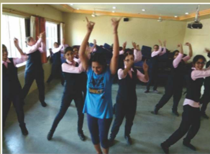
Bokawa –Short term Course