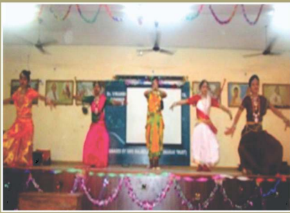
Performance in Parents' Meeting