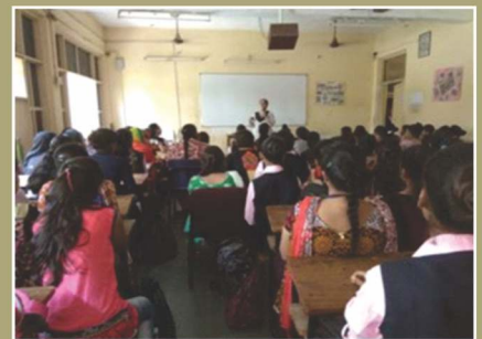
Bridge course (Sem 1)