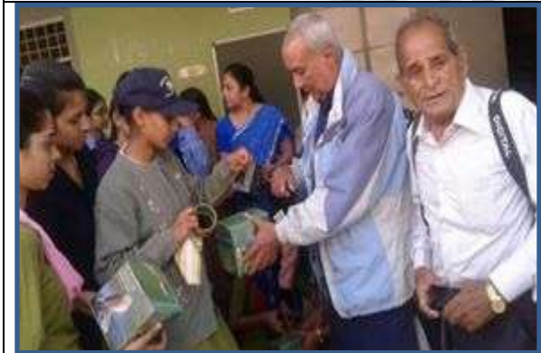
Nature Club: Bird Nest Distribution