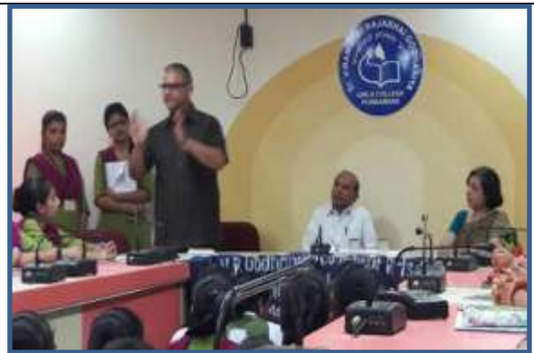
Student Development Programme