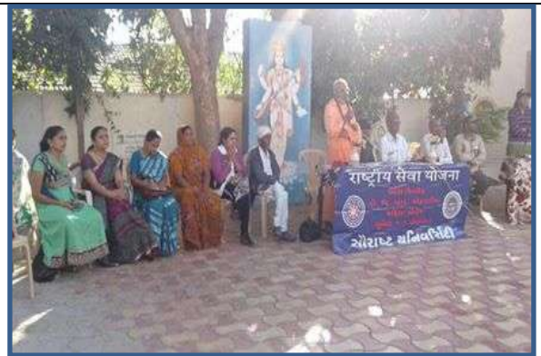
NSS : Special Camp at Vanana