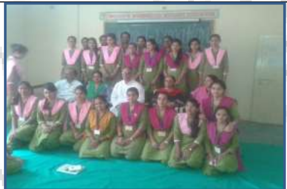
Health Center Activity