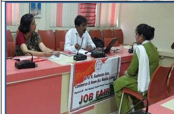
Job Fair: Career Counselling and Placement Center