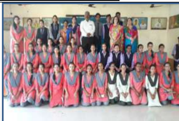
Multi-tasking Activity of PG Department