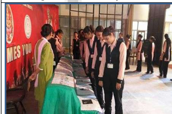
Exhibition : Commerce English Medium