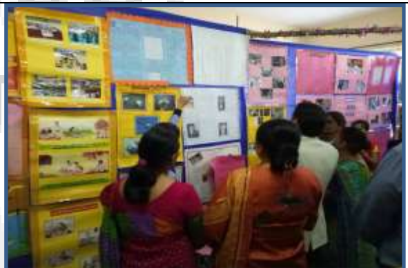
Exhibition : Economic & Commercial Concepts