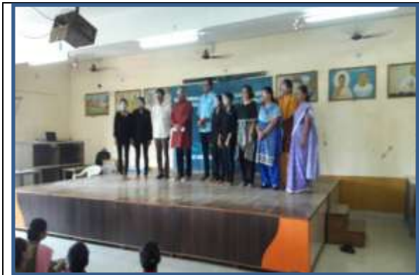
Winner Team : Mime