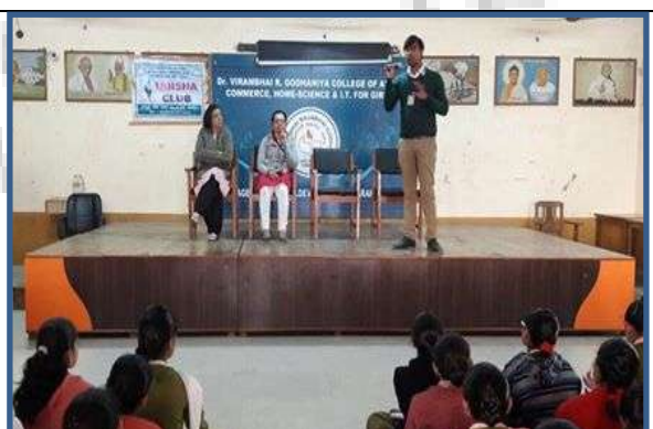
Expert Lecture : Career Guideline