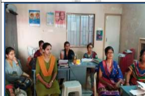
Visit to Navjivan Charitable Trust