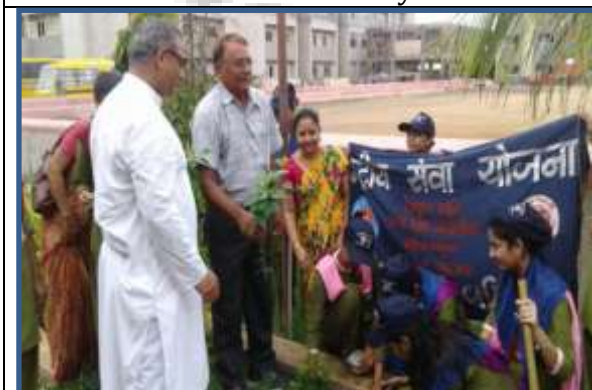
NSS : Care of Nature