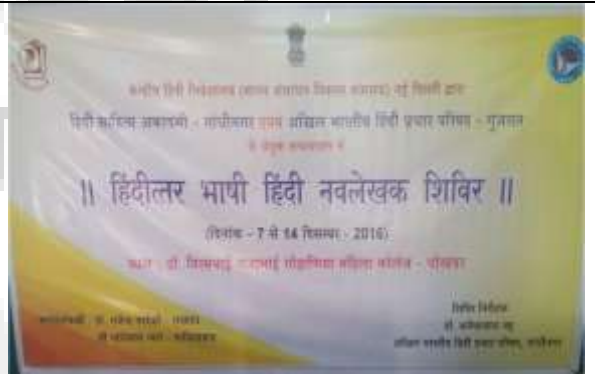
Gujarati & Hindi Sahitya Academy National Camp