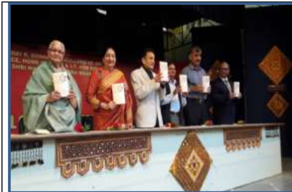
Release of Research Journal : Khoj (2016-17)