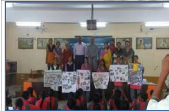
Collage Making : PG Department