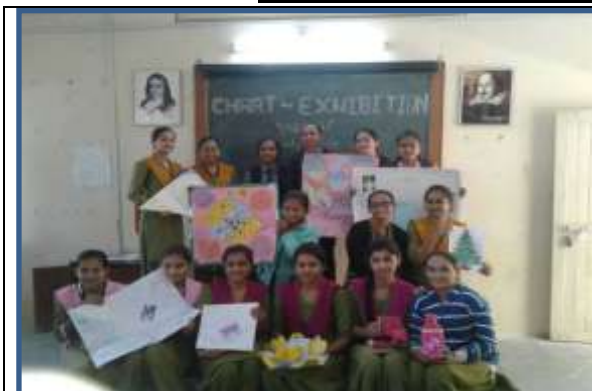
Chart Exhibition of English Department