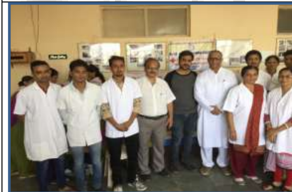
Blood Donation Camp : College Staff with Red Cross Society Team