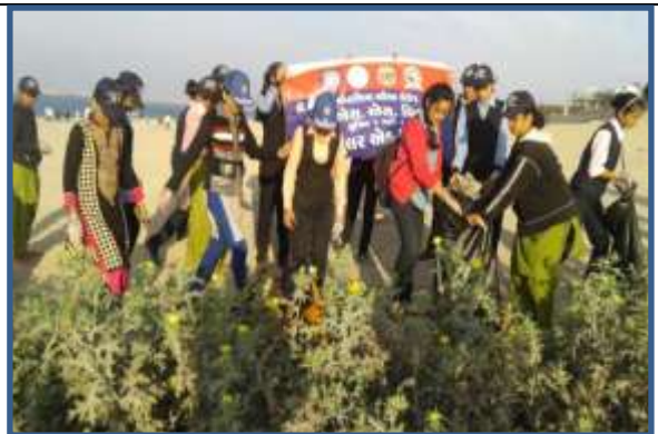
NSS : Field Work