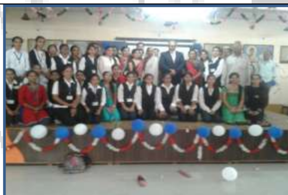
Parents Meet of English Department