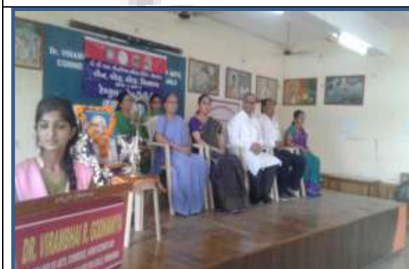
NSS : Regular Activity