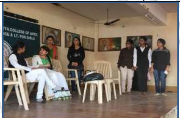
Drama in Action