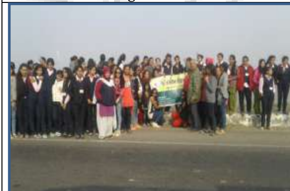
Field Trip : Nature Club