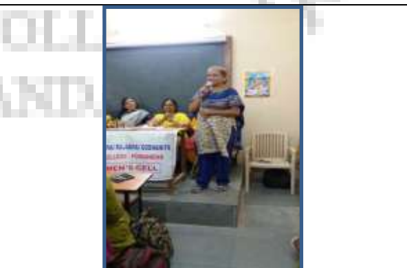
Women's Cell : Awareness Session