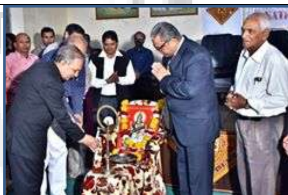
Inauguration of National Seminar