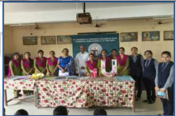
Chart Exhibition by EPP Students