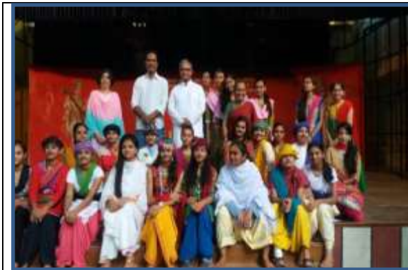
Drama Team : Gurupurnima